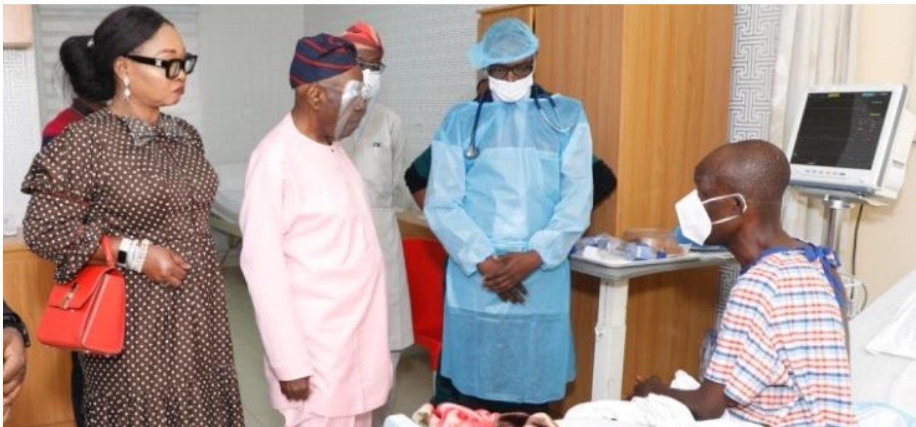
The Founder and his wife on a visit to a patient who had a kidney transplant