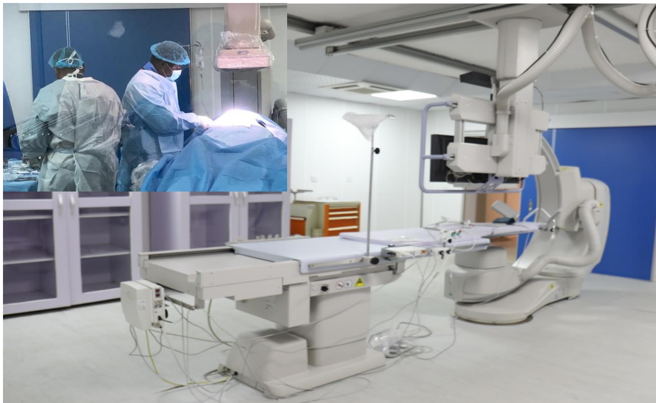
Cardiac Catheterisation Laboratory, with the insert showing the cardiac team performing a procedure

A wide range of cutting-edge open-heart surgeries and cardiac interventional procedures have been completed successfully, including multiple valve replacements, coronary artery bypass grafts, pacemaker insertions, and the repair of complex heart congenital disabilities. On record, the Cardiac Unit has performed over a hundred procedures within five years of its establishment with an excellent success rate. These contributions to cardiac health have dramatically improved outcomes in the area of cardiac health and treatment.