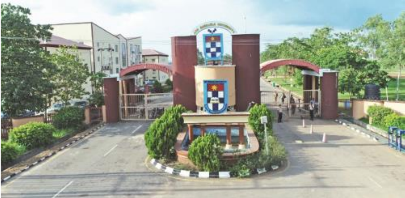
The University Gate

The University commenced operation in 2010. In its 12 years of existence, it has taken its deserved place as the pride of University education in Nigeria.