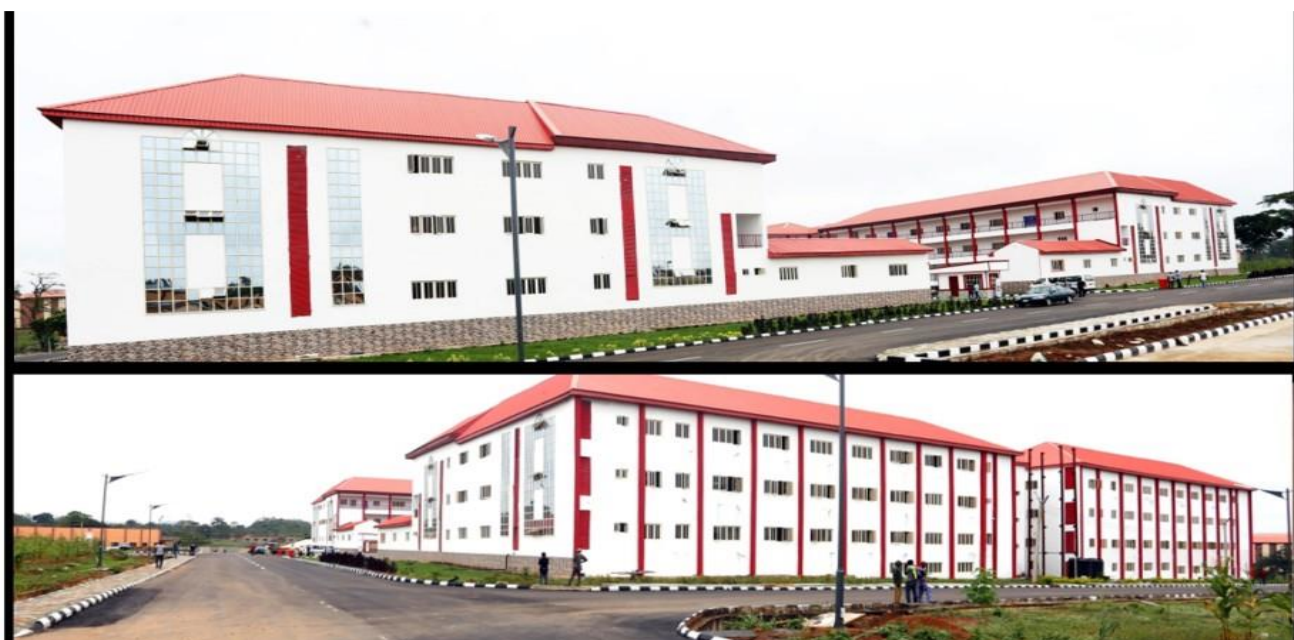
Front and side views of the Hospital