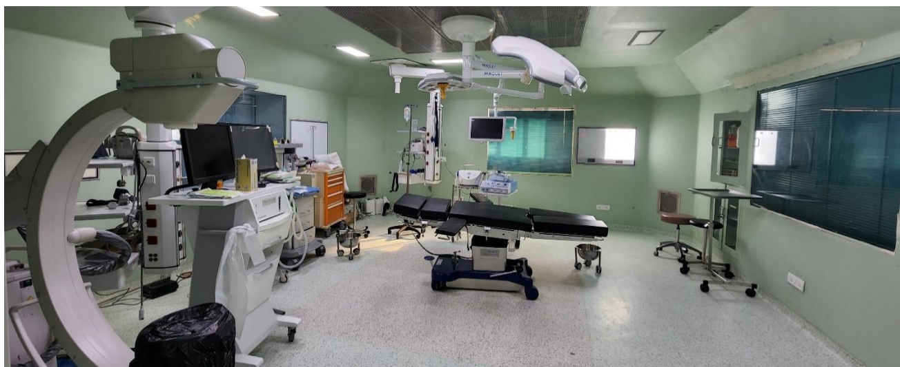
A typical suite in the modular theatre