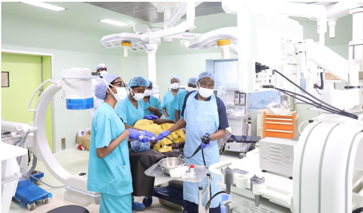
An upper GIT endoscopy and biopsy carried out on a patient being investigated for gastric cancer