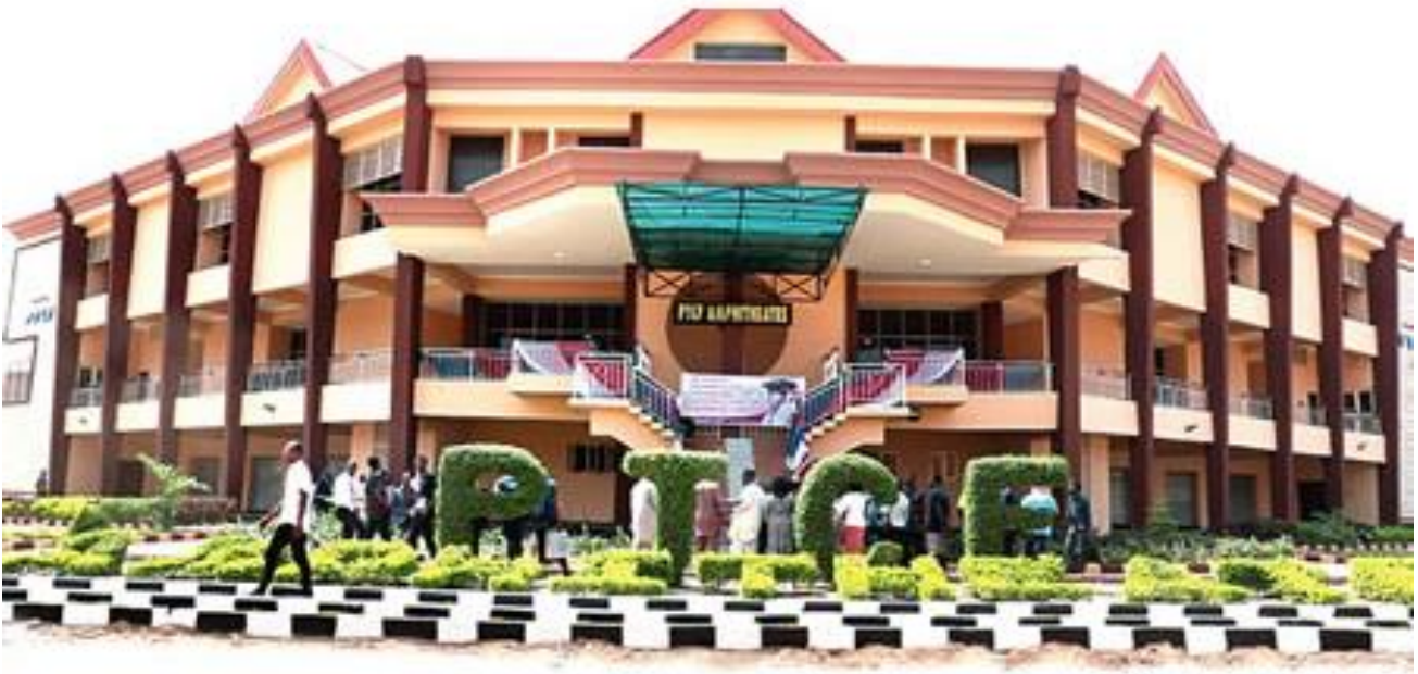
The Parent Teachers Consultative Building