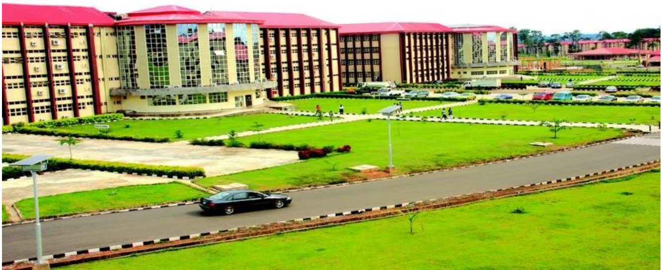
The College of Sciences Building