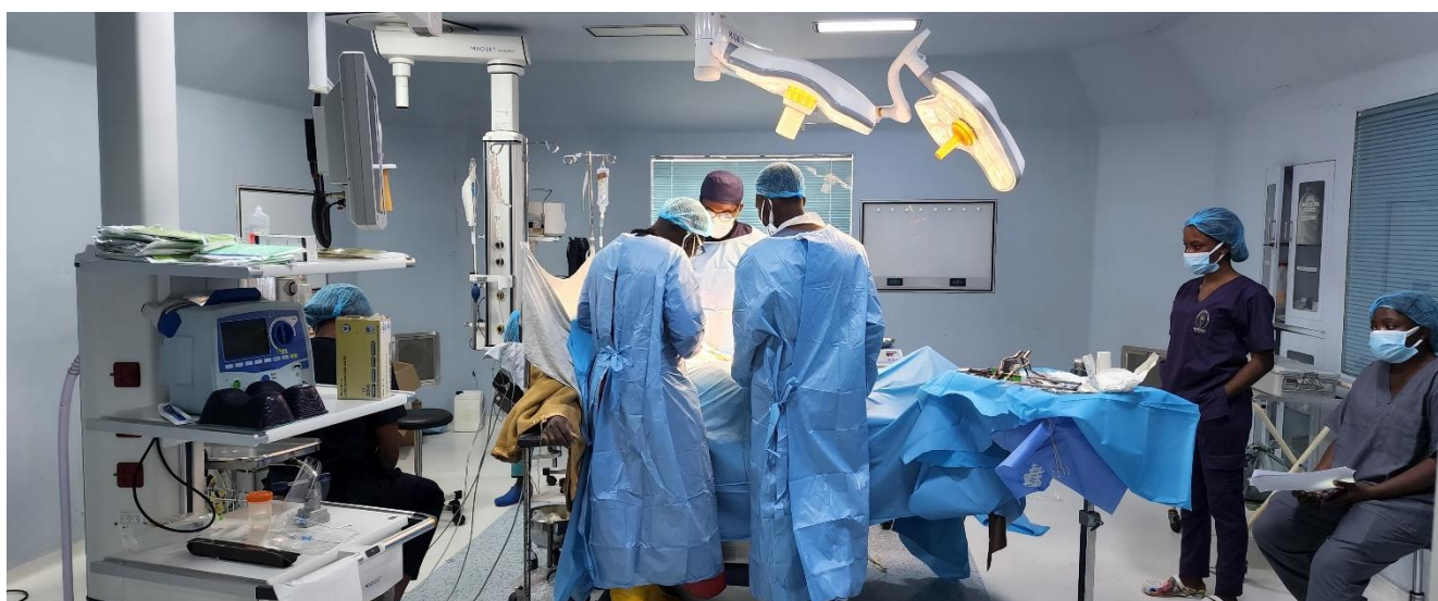
A surgical procedure being performed in one of the theatre suites