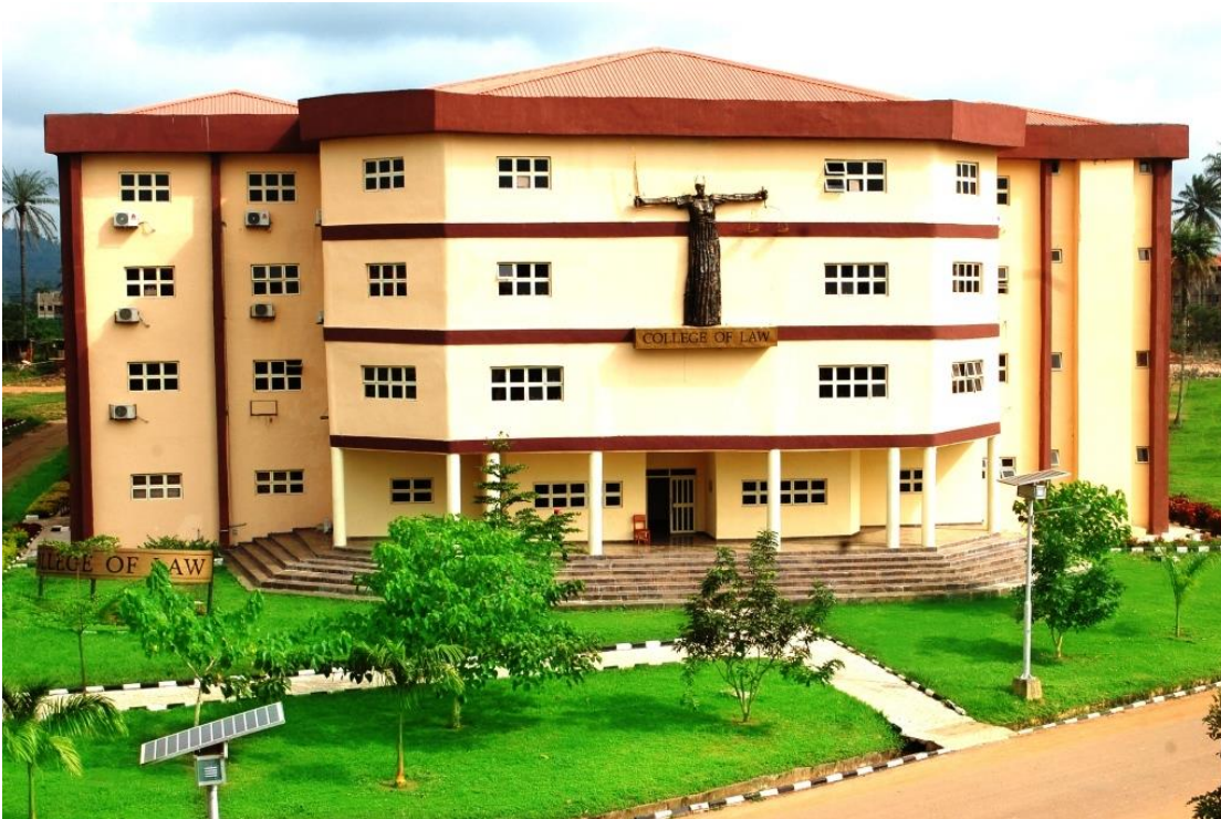
College of Law

The University operates a Collegiate System with eight Colleges: College of Medicine & Health Sciences, College of Law, College of Engineering, College of Social & Management Science, College of Sciences, College of Pharmacy and College of Postgraduate Studies.