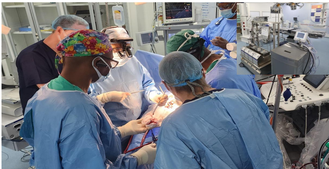
Open heart surgery being performed in the dedicated cardiac theatre. Picture also shows the heart-lung machine in the insert.

In April 2021, the Hospital successfully carried out an endovascular stent placement to repair an abdominal aortic aneurysm. That was the first time such a procedure would be done in Nigeria. Little wonder, then, that the Nigerian Cardiac Society, at its golden jubilee celebration in September 2021, delightfully honoured the Hospital with the Distinguished Service Award for our numerous contributions to cardiovascular health and services. In addition, in December 2021, VOOM Foundation, a US-based team of Surgeons and Clinicians in partnership with the Multi-System Hospital and Healthy Heart Foundation, HHF, provided free open-heart surgery to patients at the ABUAD Multi-System Hospital.