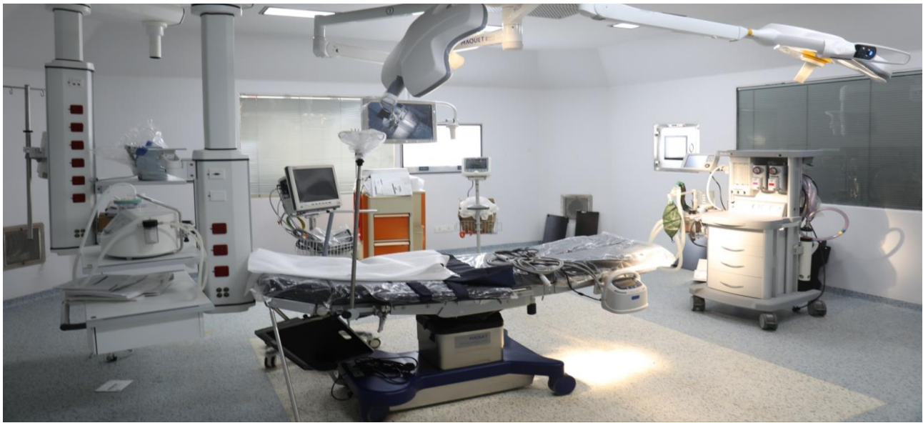
The transplant theatre