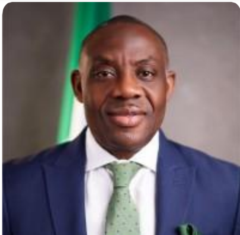
Dr Tunji Alausa Federal Minister of Education , Nigeria