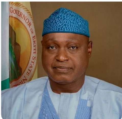
His Excellency, Governor Biodun Oyebanji Governor of Ekiti State, Nigeria